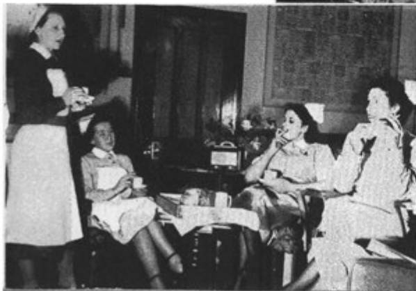
A break for Tea