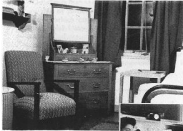
A Student Nurse's Bedroom