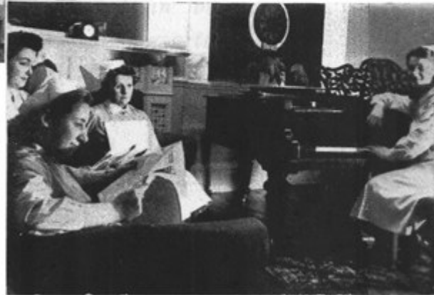
Nurses' Sitting Room

The hospital also possesses a modern hairdressing saloon which is under the supervision of a qualified ladies' hairdresser, and a well-stocked canteen for the sale of sweets, cigarettes, sundries etc. Nurses have their own dining room where they are waited on at meal times by the hospital domestic staff. The food provided in the hospital is as excellent as circumstances permit and every effort is made by our qualified catering staff to ensure that the meals are as attractive and varied as possible.