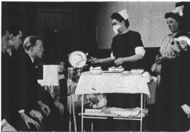
Demonstration to students

ACCOMMODATION : The hospital is fortunate in possessing a modern and attractive Nurses' Home in the grounds. Each nurse is provided with a separate bedroom and it is the aim of the hospital authorities to make the nurses' accommodation as homely and comfortable as possible. Comfortable sitting rooms are provided with radio and piano, and laundry and ironing facilities are available in the Home so that the nurses may, if they choose, launder their personal clothing. Kitchens, too, are provided in the Home, where nurses may make hot drinks.